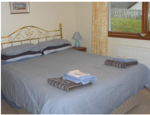
Main Bedroom Ensuite with Mountain views